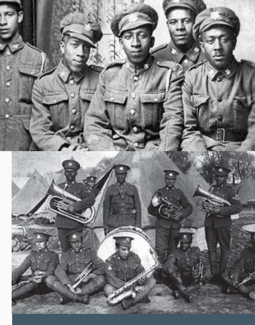
No. 2 Construction Battalion marching band in Truro, Nova Scotia in 1916.

The Crisis (We Return) by W.E.B. Du Bois