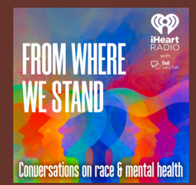
We recommend the episode Men & Mental Health Content Warning for Gun Violence

The Anna Freud Centre has a five part podcast series exploring <u>racism and</u> <u>mental health in schools</u>